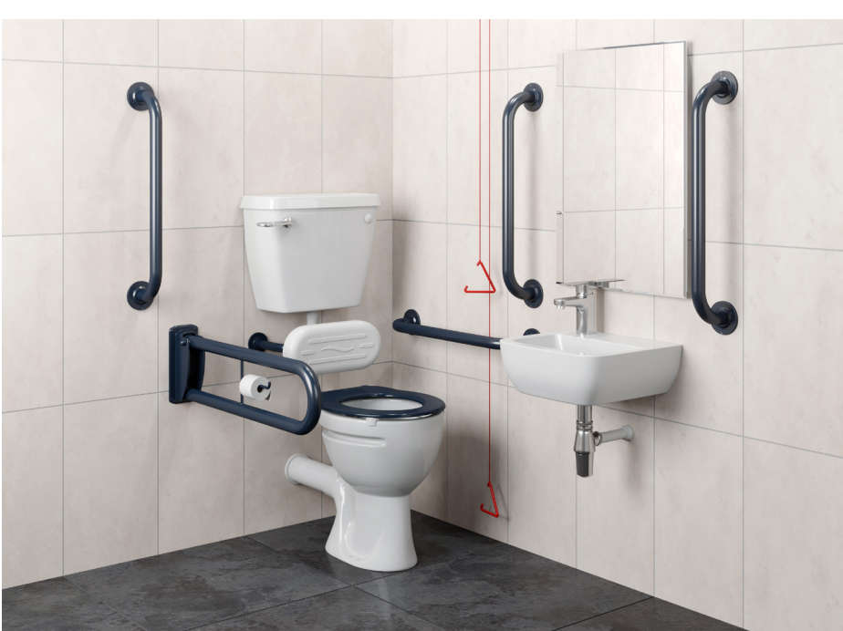
Grey RAL7005 LRV 18.52